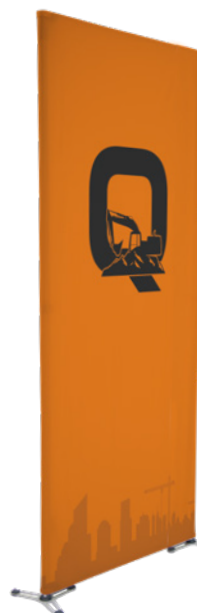
3'W wall double-sided