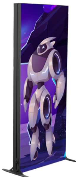
3'W x 8'H wall