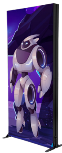
3'W x 6.5'H wall